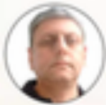
Dr. H S Trehan Delhi